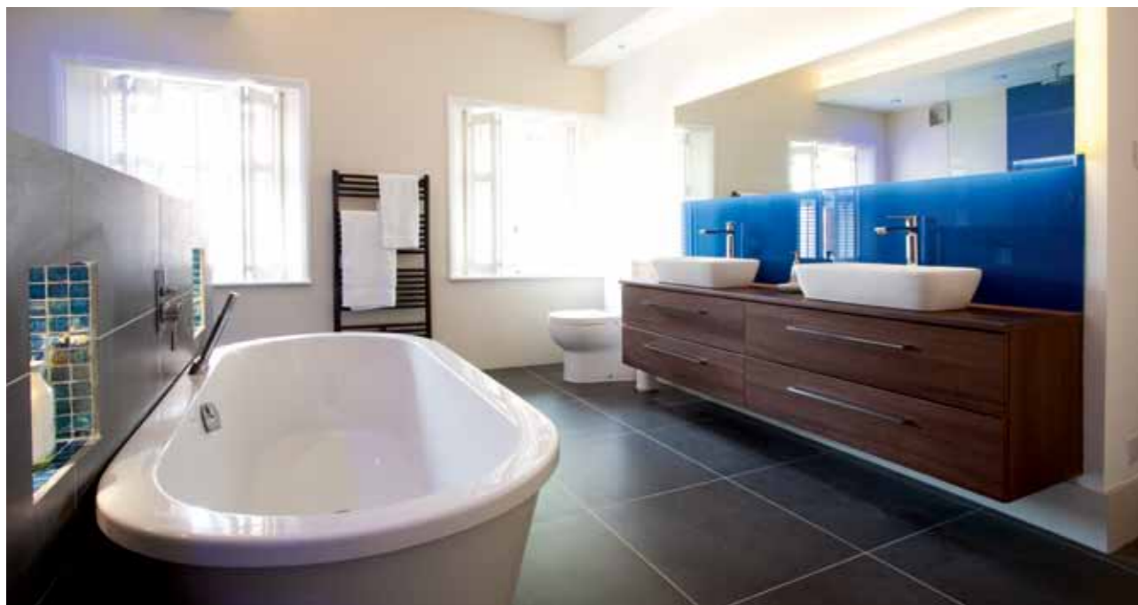
vanity units provide a base for a pair of Solo basins with Hansgrohe Metris mixers, all from Ripples