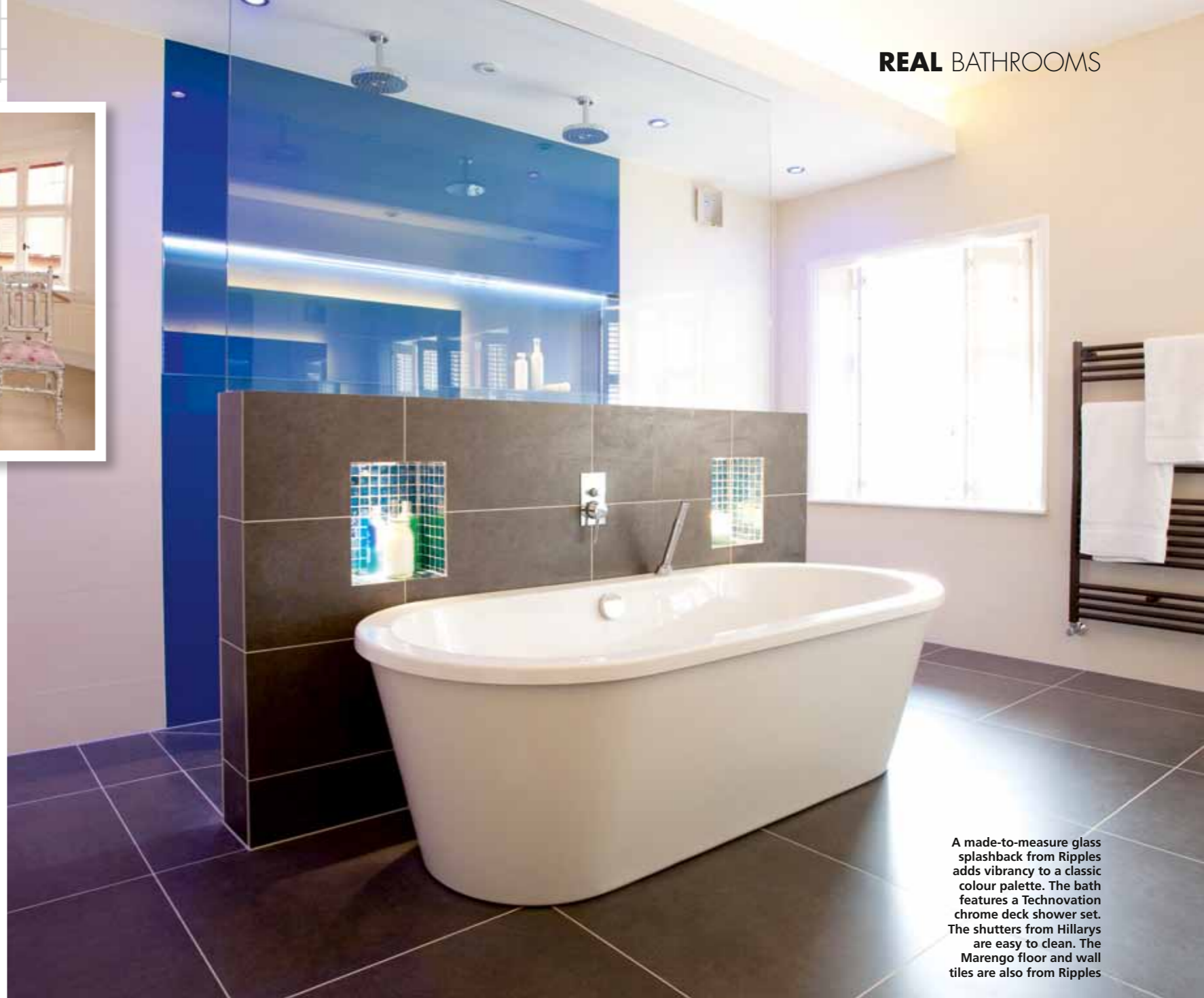
A made-to-measure glass splashback from Ripples adds vibrancy to a classic colour palette. The bath features a Technovation chrome deck shower set. The shutters from Hillarys are easy to clean. The Marengo floor and wall tiles are also from Ripples