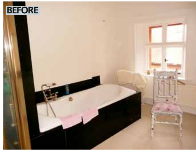
Above Lacking character, the original bathroom was uninspiring and failed to maximise the available space and light